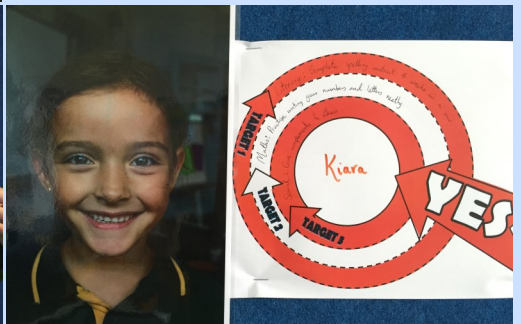
We set personal goals in Maths, Literacy and Social Skills.