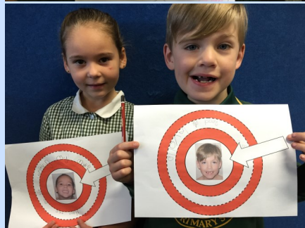
We set personal goals for our writing

Our Receptions are showing excellent ability to set personal goals and achieve them also.